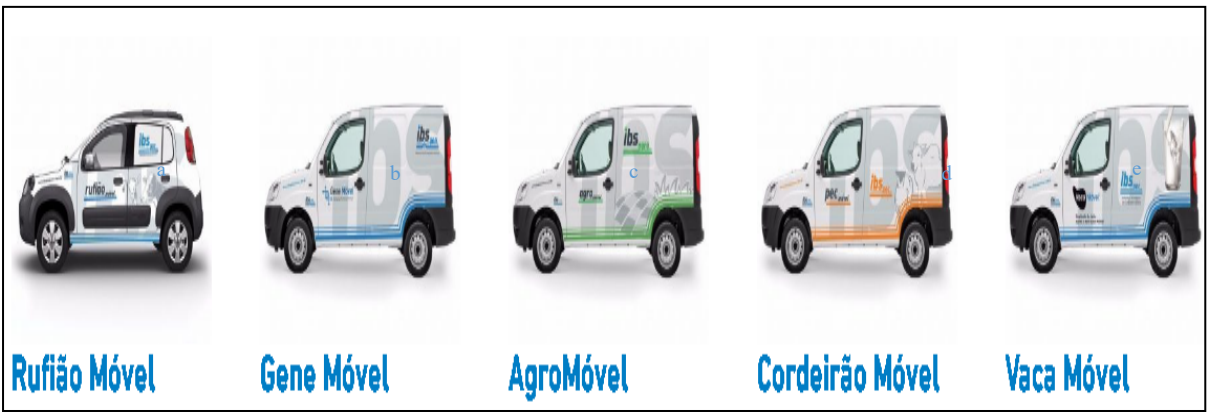
Figure 3. Mobile units<sup>4</sup>

The first mobile unit launched by IBS was baptized as "Vaca Móvel" (or "Mobile Cow"). The idea of adapting a vehicle came from an attempt to facilitate and increase the efficiency of problem solutions and the needs identification of the services beneficiaries. VacaMóvel, therefore, is composed of laboratory instruments that allow analysis in the rural environment.